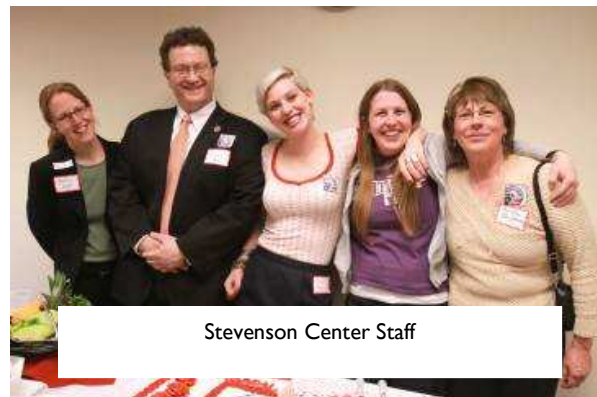
Stevenson Center Staff