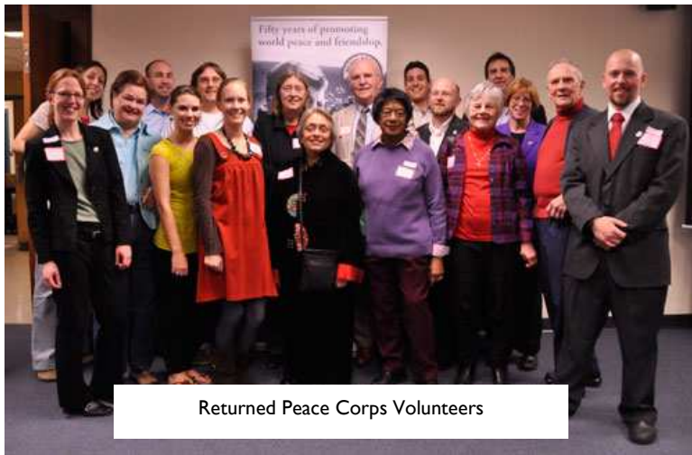
Returned Peace Corps Volunteers