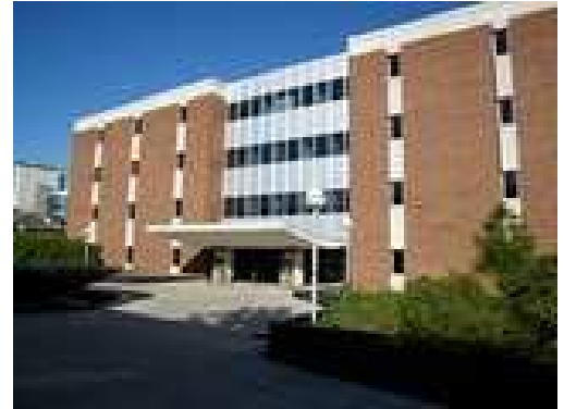
Stevenson Hall, Pohlmann Resource and Conference Room, 435C

The remodeled space features two new work stations for students as well as new furniture. Some cabinets were removed and walls re-painted. There are also funds set aside for books, journals and software.